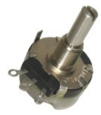
Representative photograph, actual product appearance may vary.

Due to regional agency approval requirements, some products may not be available in your area. Please contact your regional Honeywell office regarding your product of choice.